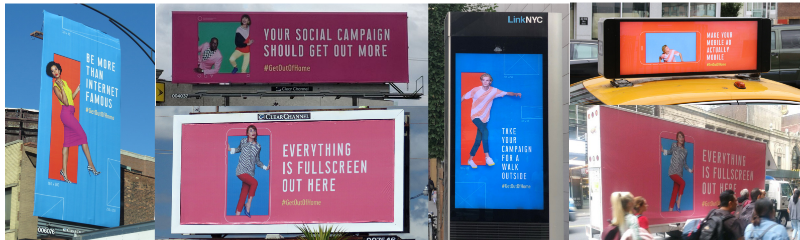
The Get Out of Home campaign spotlights OOH's diversity and connection to digital and mobile channels.

I'd love to know your thoughts on the upcoming conference. Please contact me at nfletcher@oaaa.org or call OAAA at (202) 833-5566.